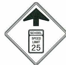
REDUCE SPEED SCHOOL ZONE AHEAD

COLOR: BORDER AND ARROW: BLACK (NON-REFLECTORIZED) BACKGROUND: FLOURESCENT YELLOW-GREEN (REFLECTORIZED) SYMBOL: BLACK BORDER AND TEXT ON WHITE BACKGROUND (REFLECTORIZED)