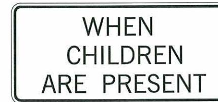
WHEN CHILDREN ARE PRESENT

COLOR: BORDER AND LEGEND: BLACK (NON-REFLECTORIZED) BACKGROUND: WHITE (REFLECTORIZED)