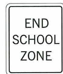
END SCHOOL ZONE

COLOR: BORDER AND LEGEND: BLACK (NON-REFLECTORIZED) BACKGROUND: WHITE (REFLECTORIZED)