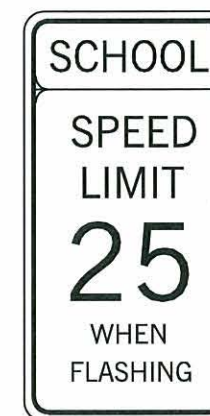
SCHOOL SPEED LIMIT

BOTTOM PANEL BACKGROUND - WHITE (REFLECTORIZED) LEGEND - BLACK (NON-REFLECTORIZED)