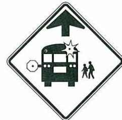
SCHOOL BUS STOP AHEAD

COLOR: BORDER AND LEGEND: BLACK (NON-REFLECTORIZED) BACKGROUND: FLOURESCENT YELLOW-GREEN (REFLECTORIZED) * RED (REFLECTORIZED)